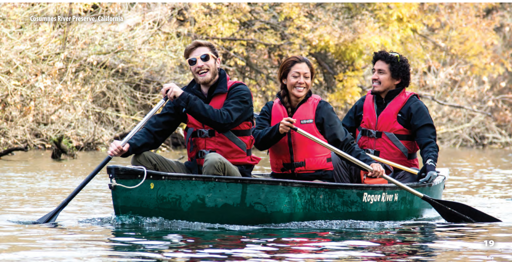
Cosumnes River Preserve, California